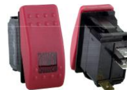
TST V-Series Switches