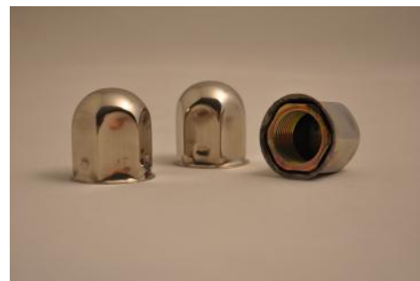
Jam Nut w/Cover