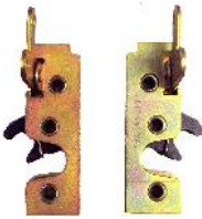
Trimark Slimline Rotary Latches