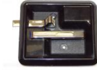
HAND-INL, right & left Interior Handle, locking or non- locking