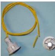
SWIT-26A Magnetic Door Switch. Two piece magnetic compartment door switch with wire lead. Requires 3/4" hole