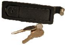
LTCH-20 Lever latch, locking, black finish.