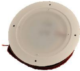
LITE-I759 LED Dome Light with Hi and Low