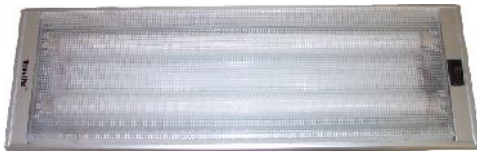
LITE-78A Thinlight 716XL with switch, uses 2, 91.10142 bulbs.